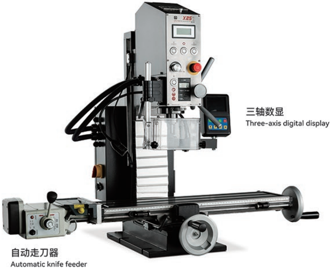
三轴数显 Three-axis digital display

High-precision and stable milling High strength and easy drilling Automatic reverse tapping Imported SKF bearings are used to improve service life and accuracy. The three-axis adopts dovetail guide rail with adjustable taper inserts, which is wear-resistant, heavy-duty, surface-contact, and rigid. 750W spindle direct drive motor, stepless speed regulation 100~2500rpm